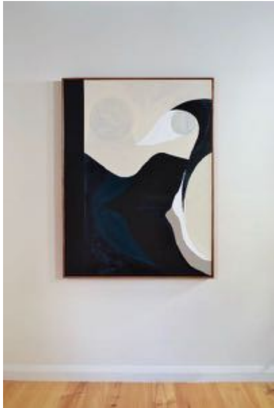
Moon God, Sun Wings, Manta Ray, 2018 1200mm x 900mm (unframed HxW) 930mm x 1230mm x 56mm (framed HxWxD) Oil on Italian Linen Canvas, transparent primed raw linen $2,850