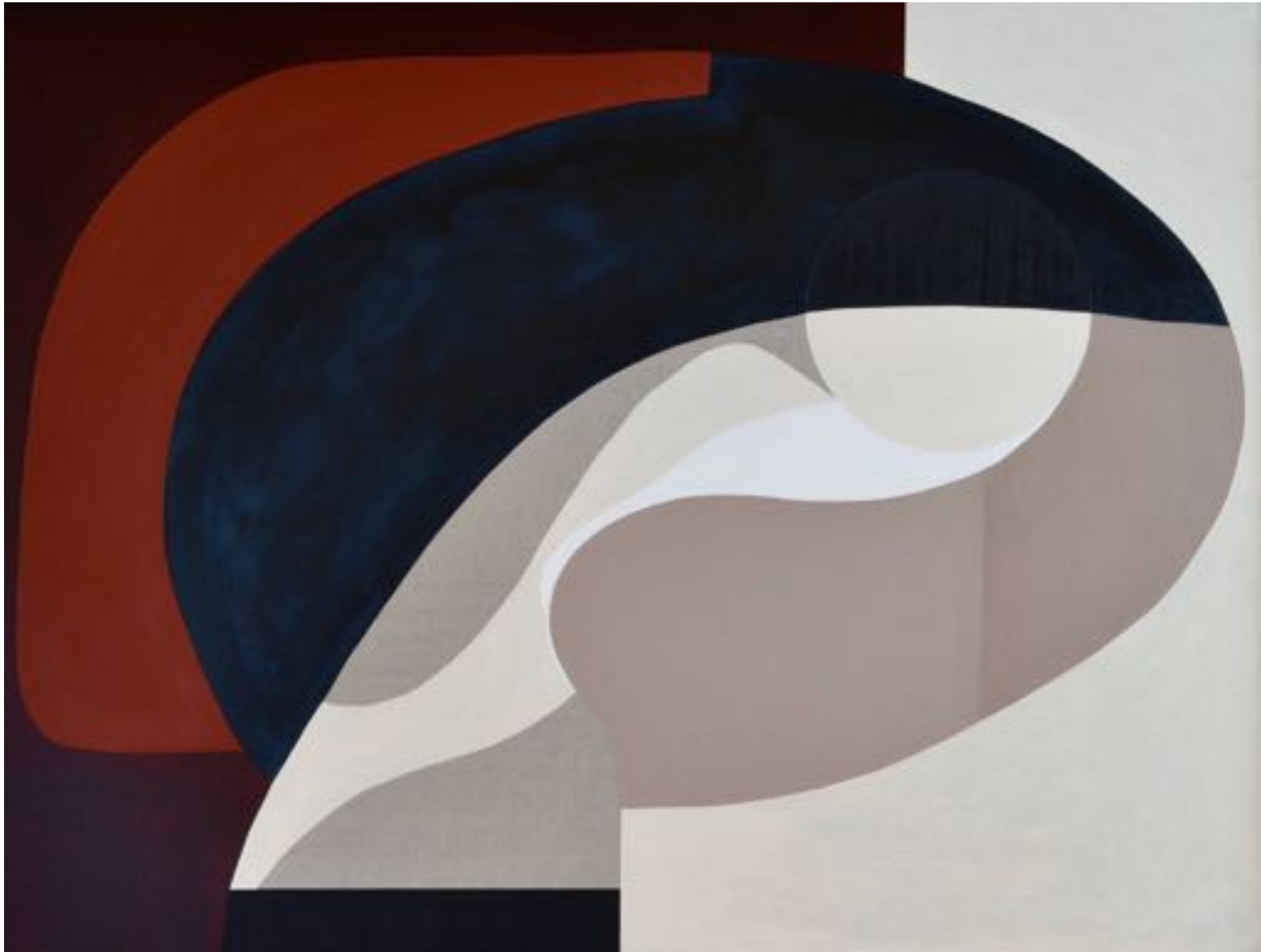
Lacuna, 2018 900mm x 1200mm (unframed HxW) 930mm x 1230mm x 56mm (framed HxWxD) Oil on Italian Linen Canvas, transparent primed raw linen $2,850