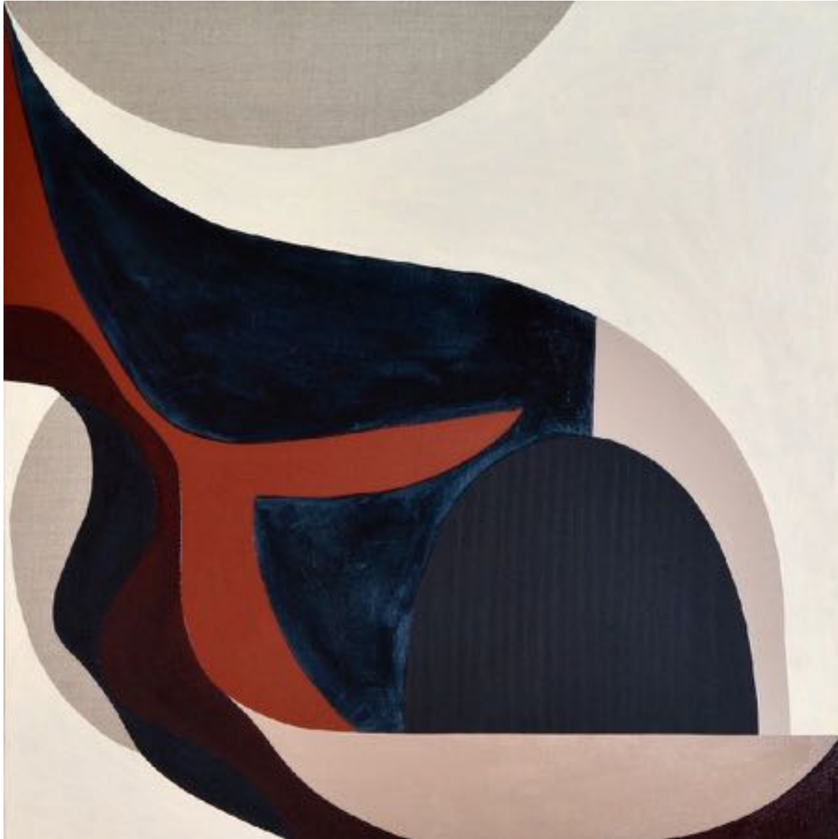
Hell or High Water, 2018 770mm x 770mm (unframed HxW) 805mm x 805mm x 56mm (framed HxWxD) Oil on Italian Linen Canvas, transparent primed raw linen $1,980