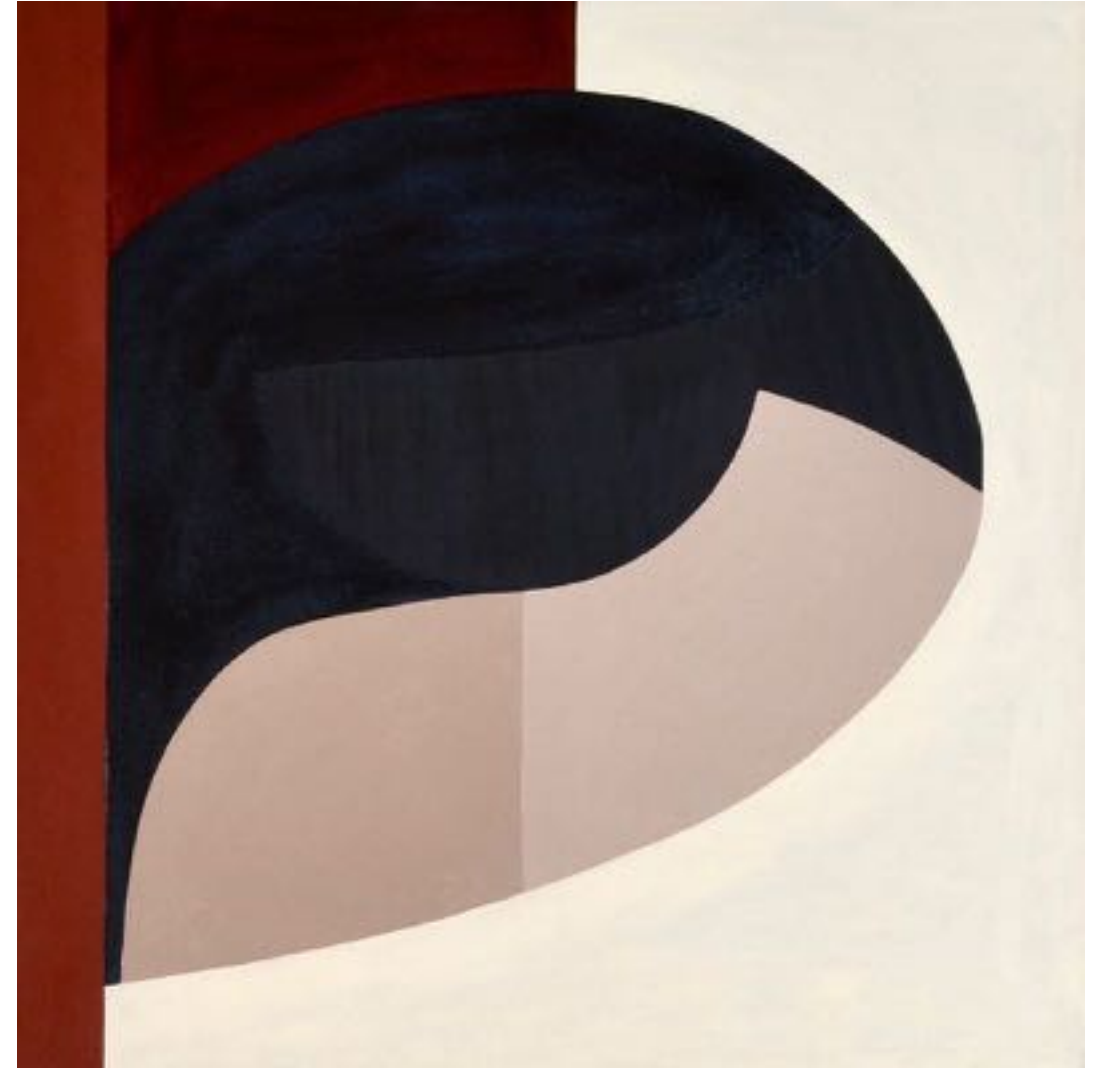
Stretching Time, 2018 570mm x 570mm (unframed HxW) 595mm x 595mm x 56mm (framed HxWxD) Oil on Italian Linen Canvas, transparent primed raw linen $1,100