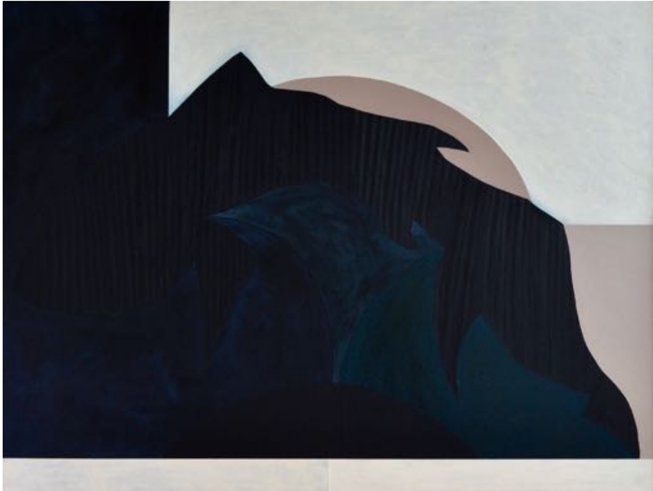
Flying Bird with a Lizards Face, 2018 900mm x 1200mm (unframed HxW) 930mm x 1230mm x 56mm (framed HxWxD) Oil on Italian Linen Canvas, transparent primed raw linen $2,850