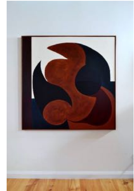
Blood Moon Rising, 2018 1200mm x 1200mm (unframed HxW) 1230mm x 1230mm x 56mm (framed HxWxD) Oil on Italian Linen Canvas, transparent primed raw linen $3,300