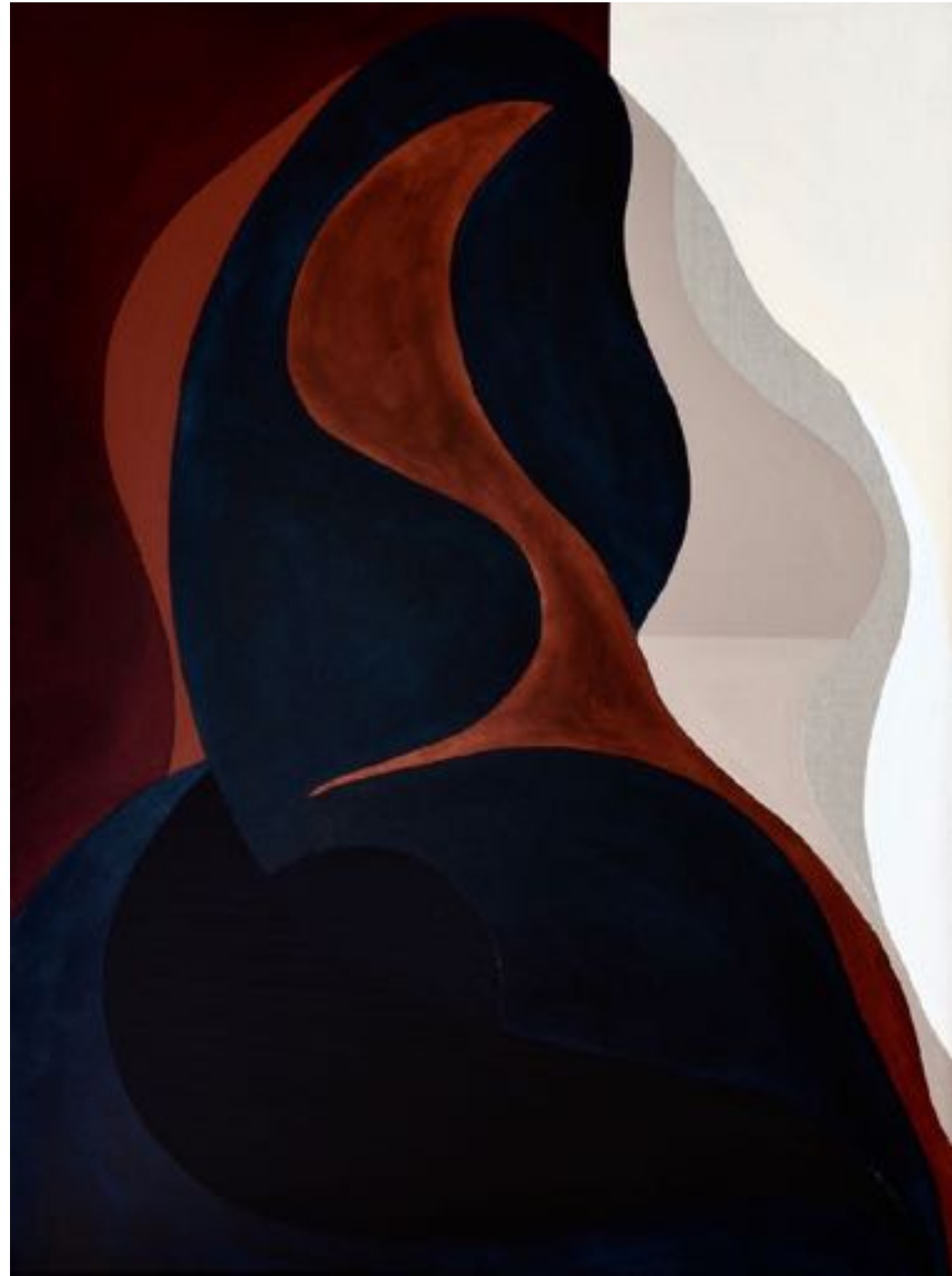
Night Falls on us Either Way, 2018 1200mm x 900mm (unframed HxW) 930mm x 1230mm x 56mm (framed HxWxD) Oil on Italian Linen Canvas, transparent primed raw linen $2,850