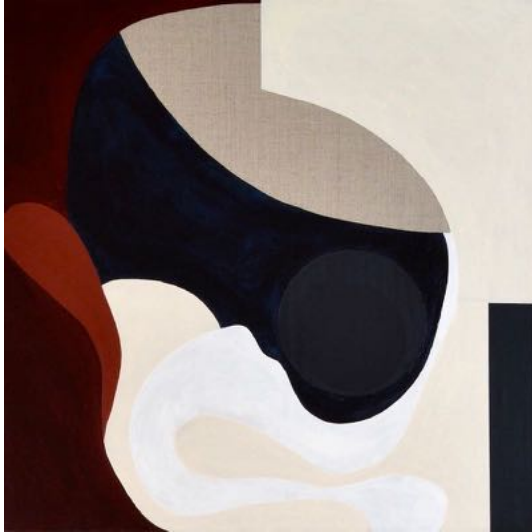
The Man on The Moon, 2018 570mm x 570mm (unframed HxW) 595mm x 595mm x 56mm (framed HxWxD) Oil on Italian Linen Canvas, transparent primed raw linen $1,100