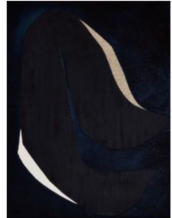
Stand Tall, 2018 340mm x 260mm (unframed HxW) 365mm x 285mm x 56mm (framed HxWxD) Oil on Italian Linen Canvas, transparent primed raw linen $620