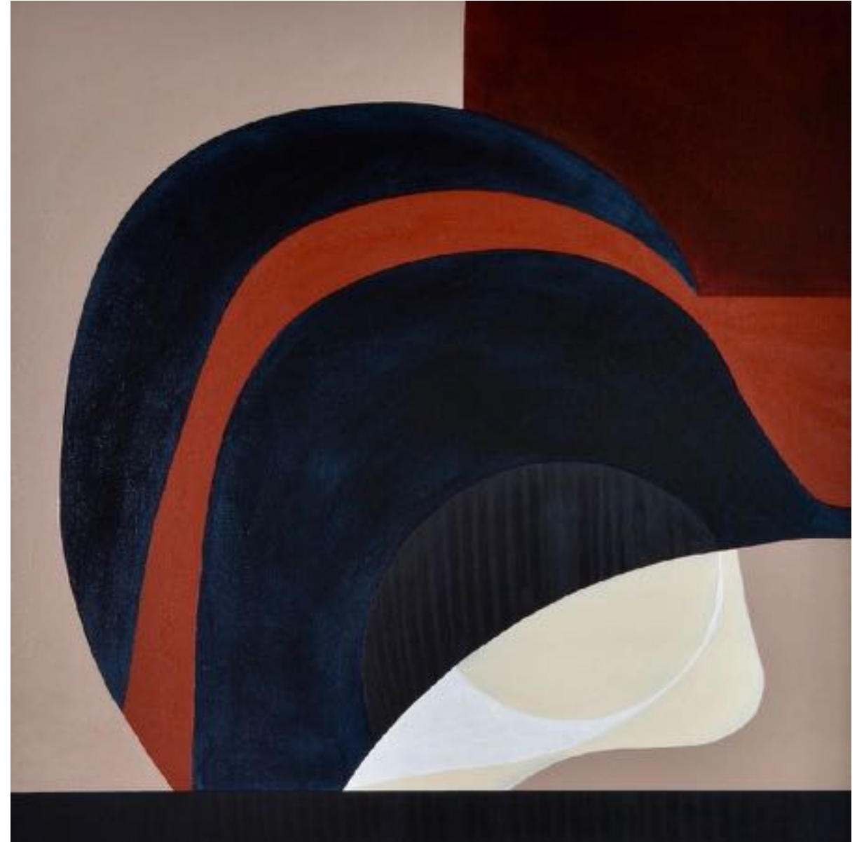
When Hell Freezes Over, 2018 770mm x 770mm (unframed HxW) 805mm x 805mm x 56mm (framed HxWxD) Oil on Italian Linen Canvas, transparent primed raw linen $1,980