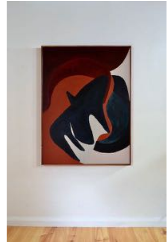
Be The Myth, When you can't be The Man, 2018 1200mm x 900mm (unframed HxW) 930mm x 1230mm x 56mm (framed HxWxD) Oil on Italian Linen Canvas, transparent primed raw linen $2,850