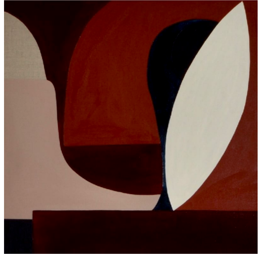
Different Worlds, Different Suns, 2018 570mm x 570mm (unframed HxW) 595mm x 595mm x 56mm (framed HxWxD) Oil on Italian Linen Canvas, transparent primed raw linen $1,100