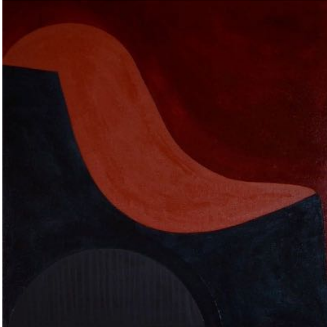
Hellfish, 2018 570mm x 570mm (unframed HxW) 595mm x 595mm x 56mm (framed HxWxD) Oil on Italian Linen Canvas, transparent primed raw linen $1,100