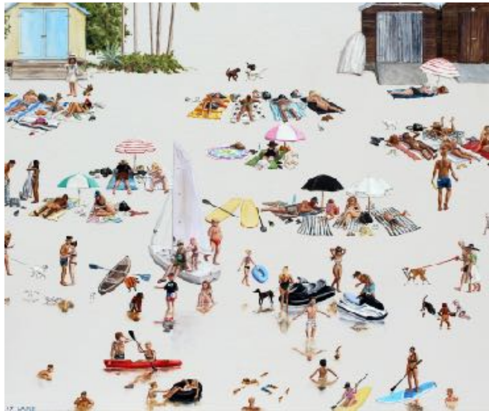
Kutti Beach- Vacluse (2017) Oil & acrylic on linen 56cmx66cm $1800