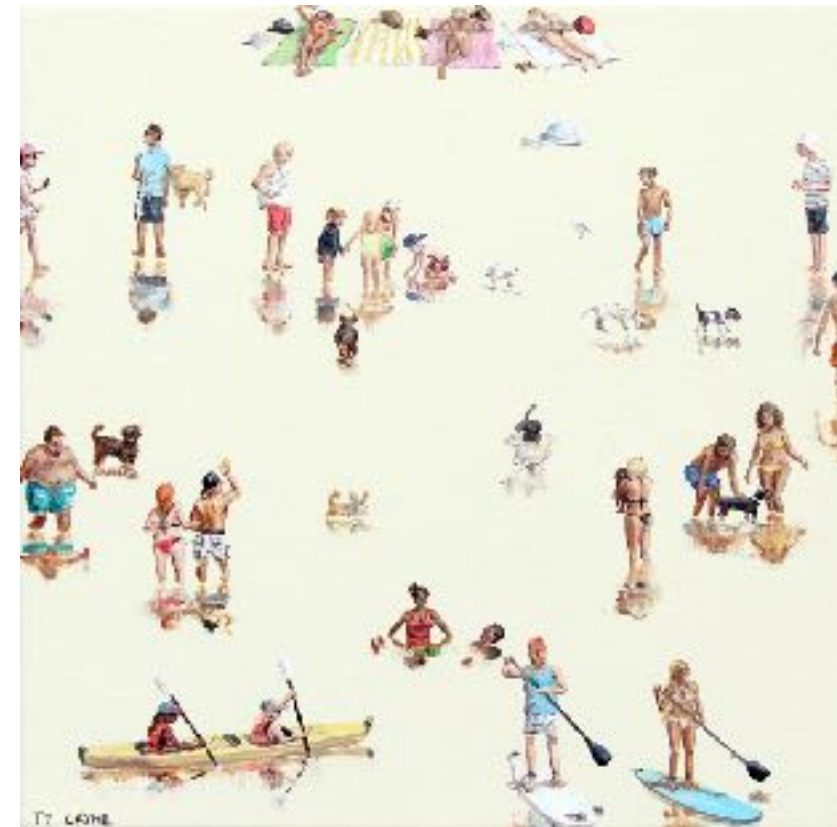
Rose Bay (2017) Oil & acrylic on linen 30.5x30.5cm $650