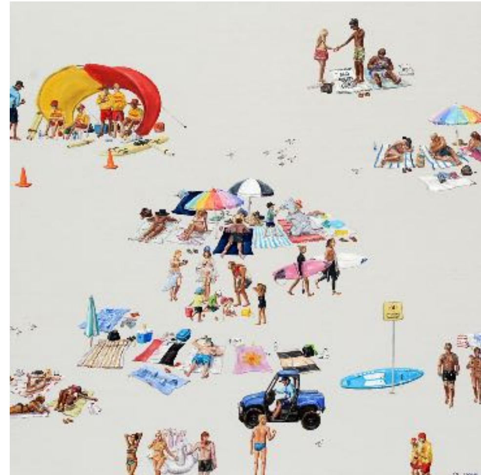
The Volunteers (2017) Oil & acrylic on linen 61x61cm $1800