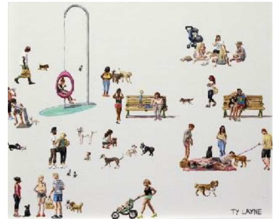
Dog Park II (2016) Oil & acrylic on board 25cm x 30cm $590