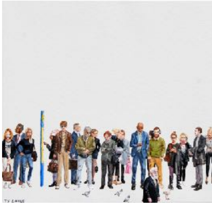
The Bus Stop (2016) Oil & acrylic on linen 35cmx37cm (2016) $690