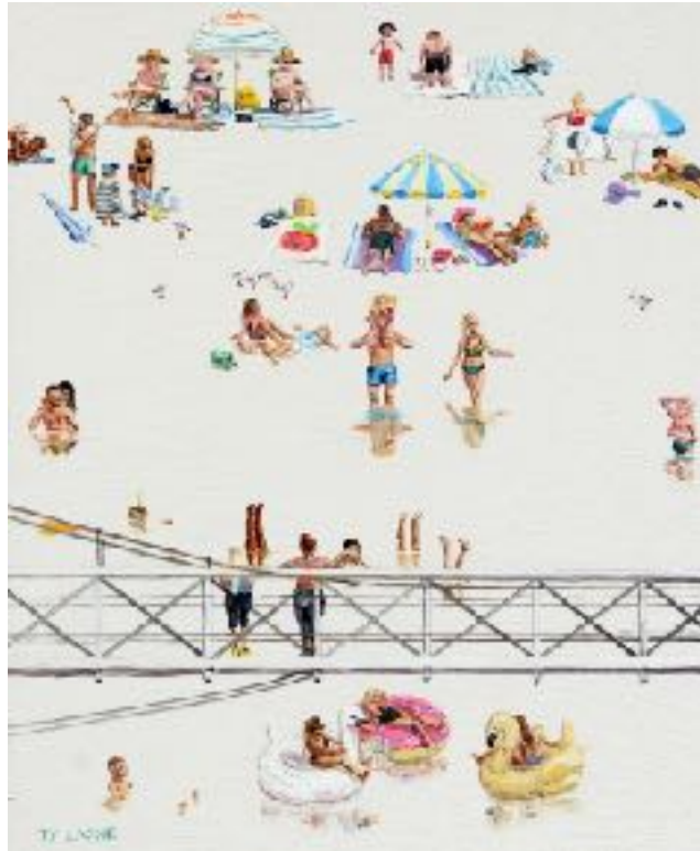
Parsley Bay (2017) Oil & acrylic on board 25x30cm $590