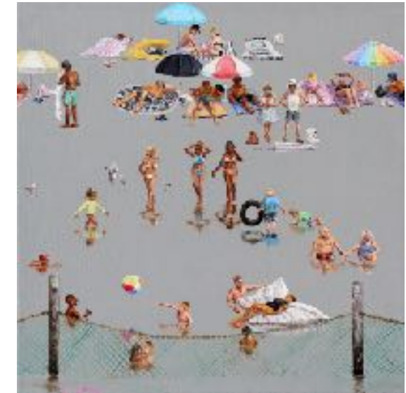
Shark Beach - Nielsen Park (2017) Oil & Acrylic on linen 30.5x30.5cm $650