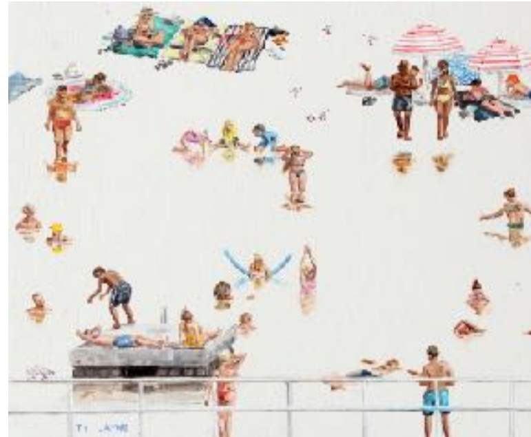
Red Leaf (2017) Oil & acrylic on board 25x30cm $590