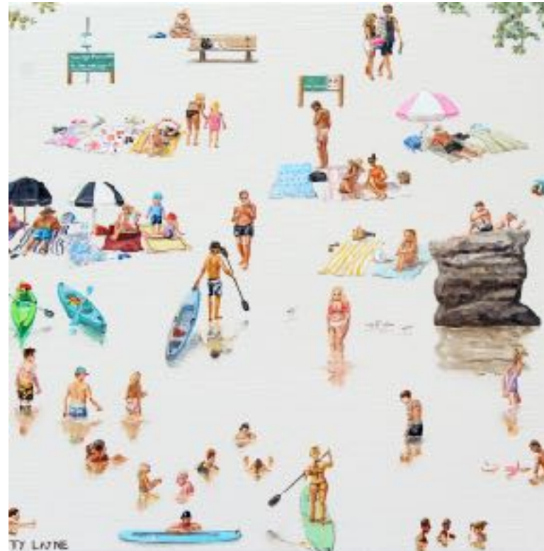
Milk Beach (2017) Oil & acrylic on linen 30.5cm x 30.5cm $650