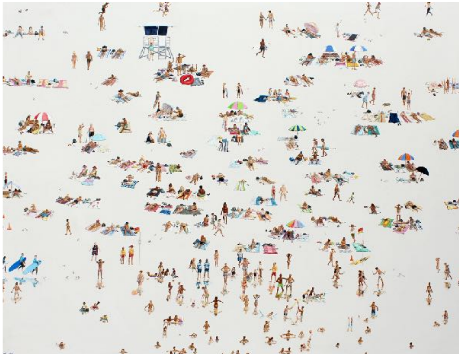
31 Degrees (2016-2017) Oil & acrylic on canvas 152cm x 198cm $6750