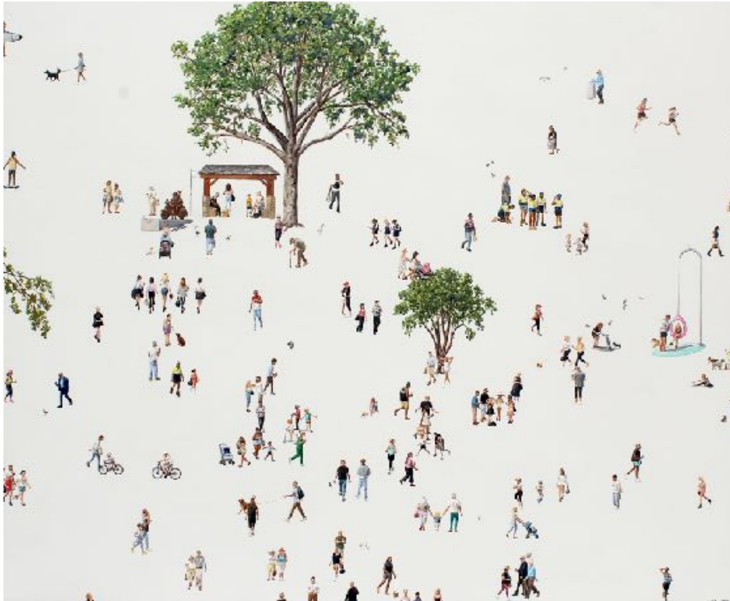
Paddington III (2017) Oil & acrylic on linen 137x167cm $5850