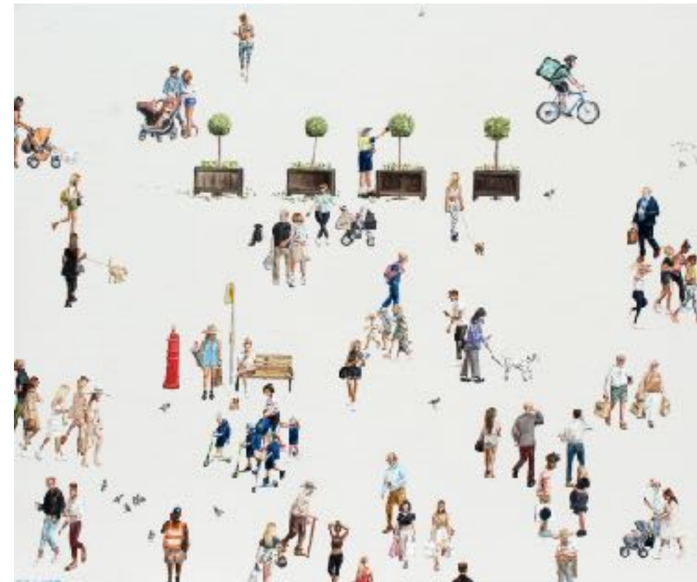
Five Ways- Paddington (2017) Oil & acrylic on linen 56 x 66cm $1800