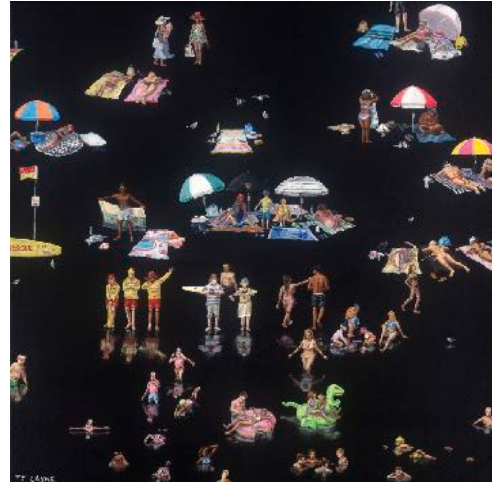
What Happens on Earth, Stays on Earth (2017) Oil & acrylic on linen 61x61cm $1800