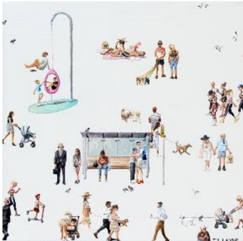
Glenmore Road (2017) Oil & acrylic on linen 30.5cm x 30.5cm $650