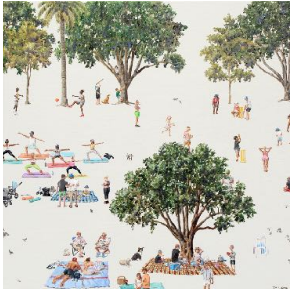
Centennial Park (2017) Oil & acrylic on linen 61x61cm $1800