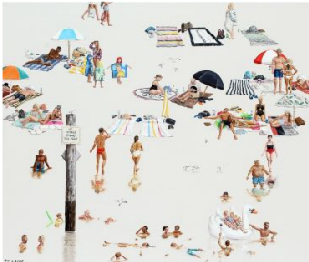
Camp Cove (2017) Oil & acrylic on linen 56x66cm $1800