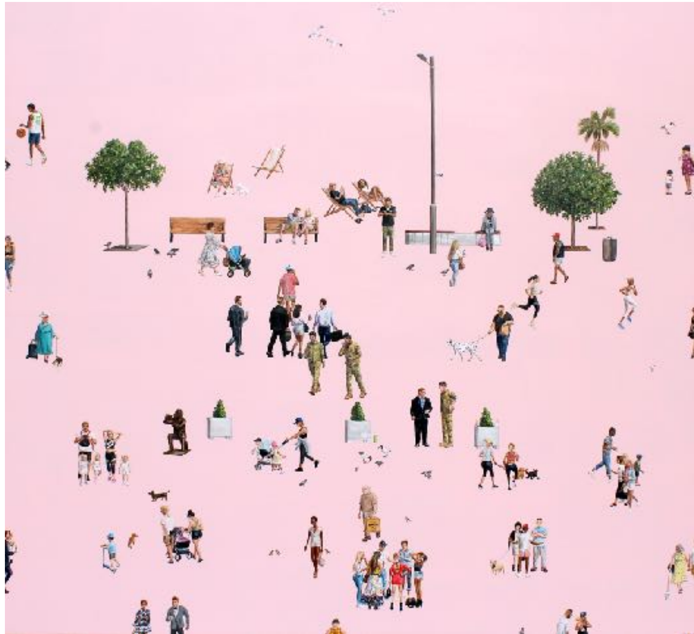
Pink Afternoon II (2017) Oil & acrylic on linen 137x152cm $5500